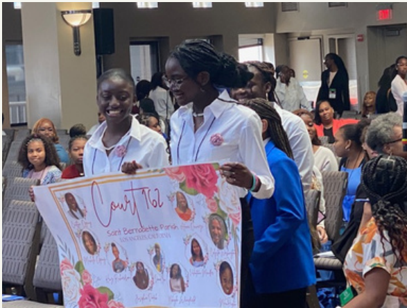
Junior Convention St. Bernardette Junior Court 162