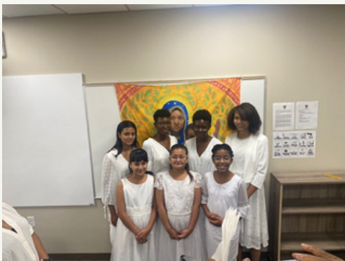
Junior Courts 358 & 369