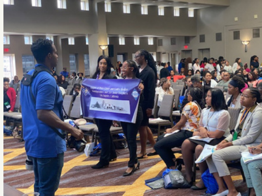
Junior Convention Transfiguration - Junior Court 220