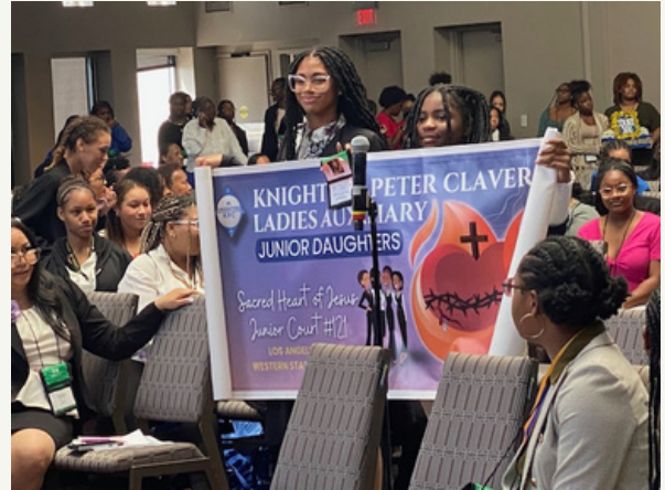
Junior Convention Sacred Heart of Jesus - Junior Court 121