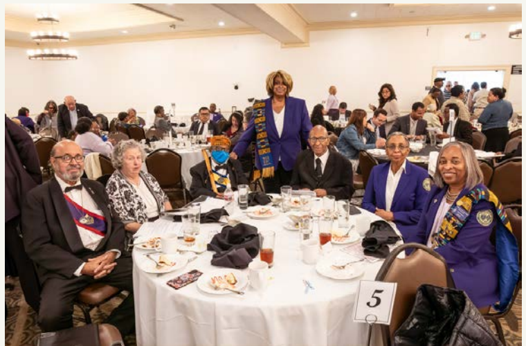
Very Important Clavers