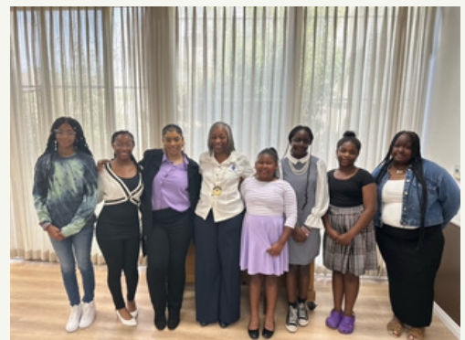
Junior Training Day at Holy Name of Jesus Catholic Church Juniors from Courts 121, 162, 220