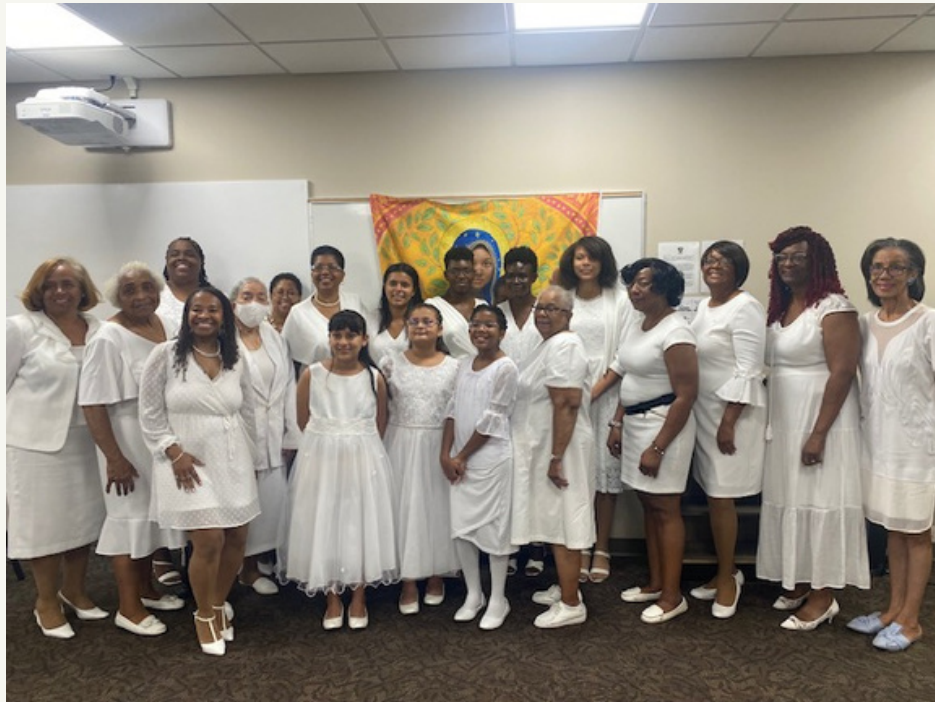
Junior & Senior Courts - Phoenix, Arizona