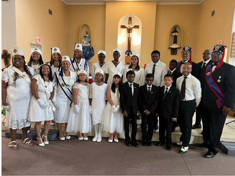
St. Josephine Bahkita - Unit 369 Phoenix, Arizona